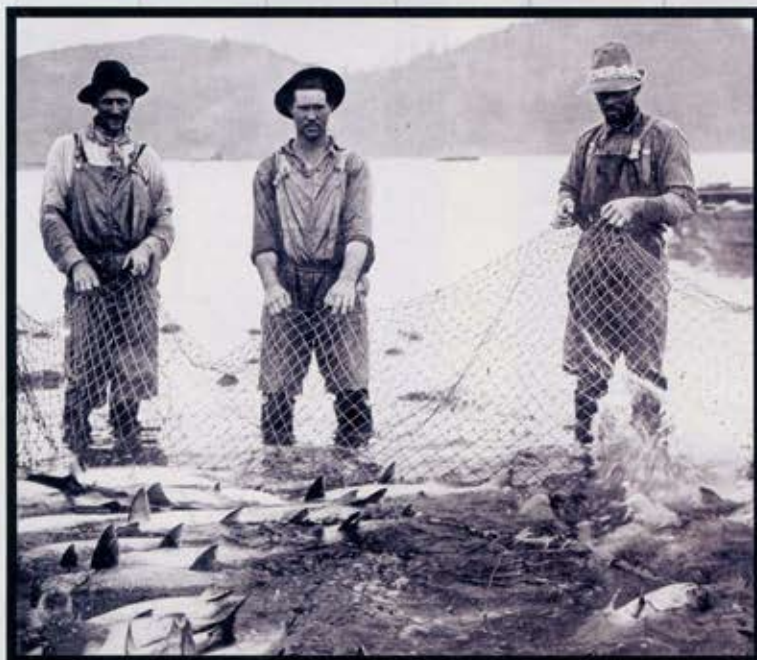
A horse seining crew.

the historic J. O. Hanthorn (Bumble Bee) Cannery, at Pier 39, Building No. 9.