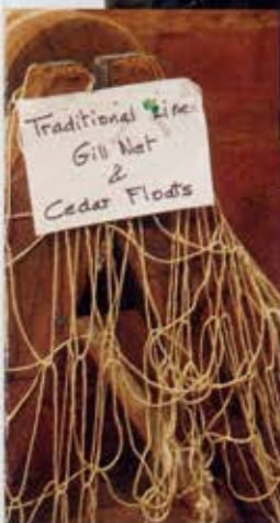
Traditional Fish Gill Net & Cedar Floats